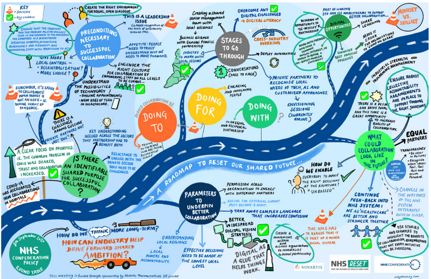
Fig 1. Parameters to underpin better collaboration

Participants identified a positive culture, empowered leaders and a good understanding of the uncertainty that exists in the health and care system at present as the critical preconditions necessary for successful collaboration.