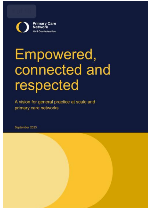
Empowered, connected and respected