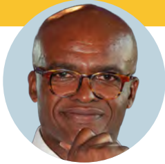
Kriss Akabusi MBE* Olympic Athlete, World Champion, Motivational Speaker and Corporate Coach