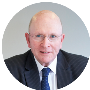
Niall Dickson CBE